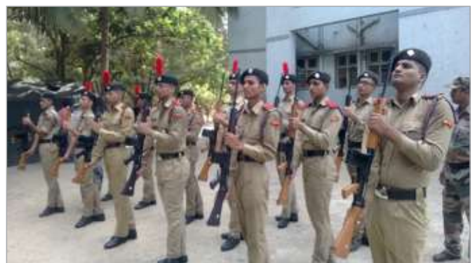
Rifle Parade (Guards)