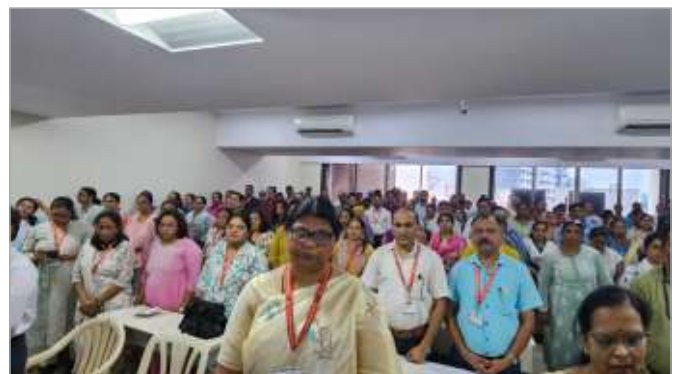
NEP Training for Junior College Teachers from 10 th to 15 th March 2025 in College