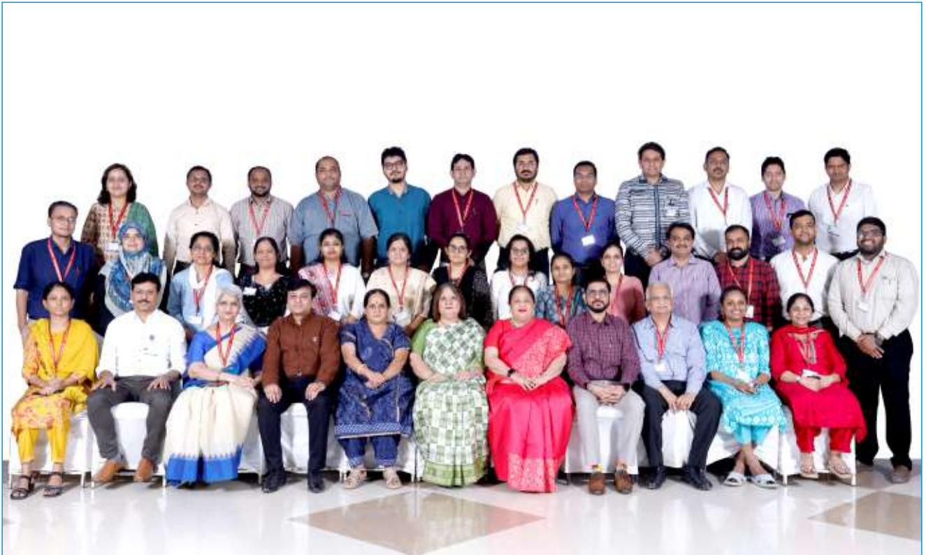
Degree College Faculty of Commerce