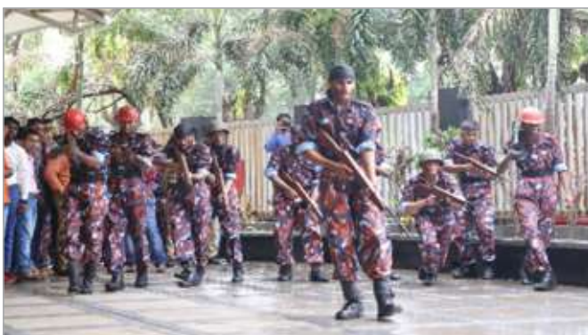
Section Attack Demonstration

Note : Mithibai College NCC Unit is open unit hence any student from any college in Mumbai can enrol in it.