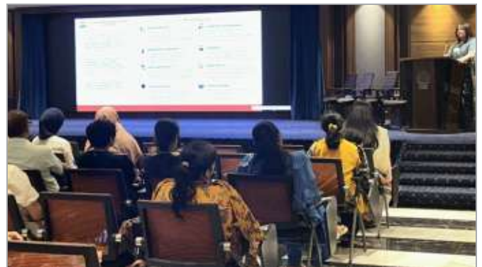
NEP Training for Parents and Students on 15 th January, 2025 at DJ Sanghvi Engineering College