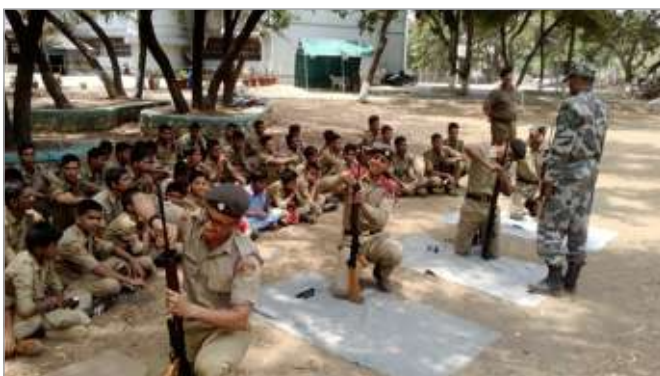
Weapon Training SLR, insas

Information about Different types of weapon used in Indian Armed Forces including tanks (T-56, T-72, T-90, MBT Arjun)