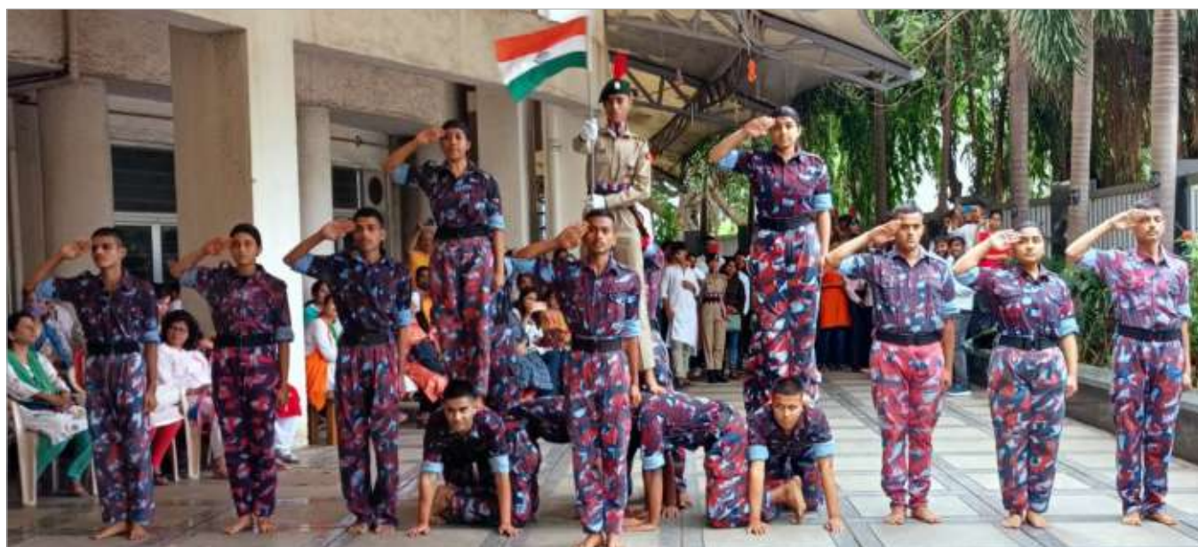
NCC Cadets performing Pyramid show on Independence Day