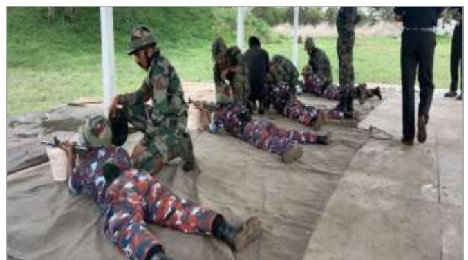
NCC Cadets doing Firing practice on INSAS Rifle at Army Attachment Camp, Pune.