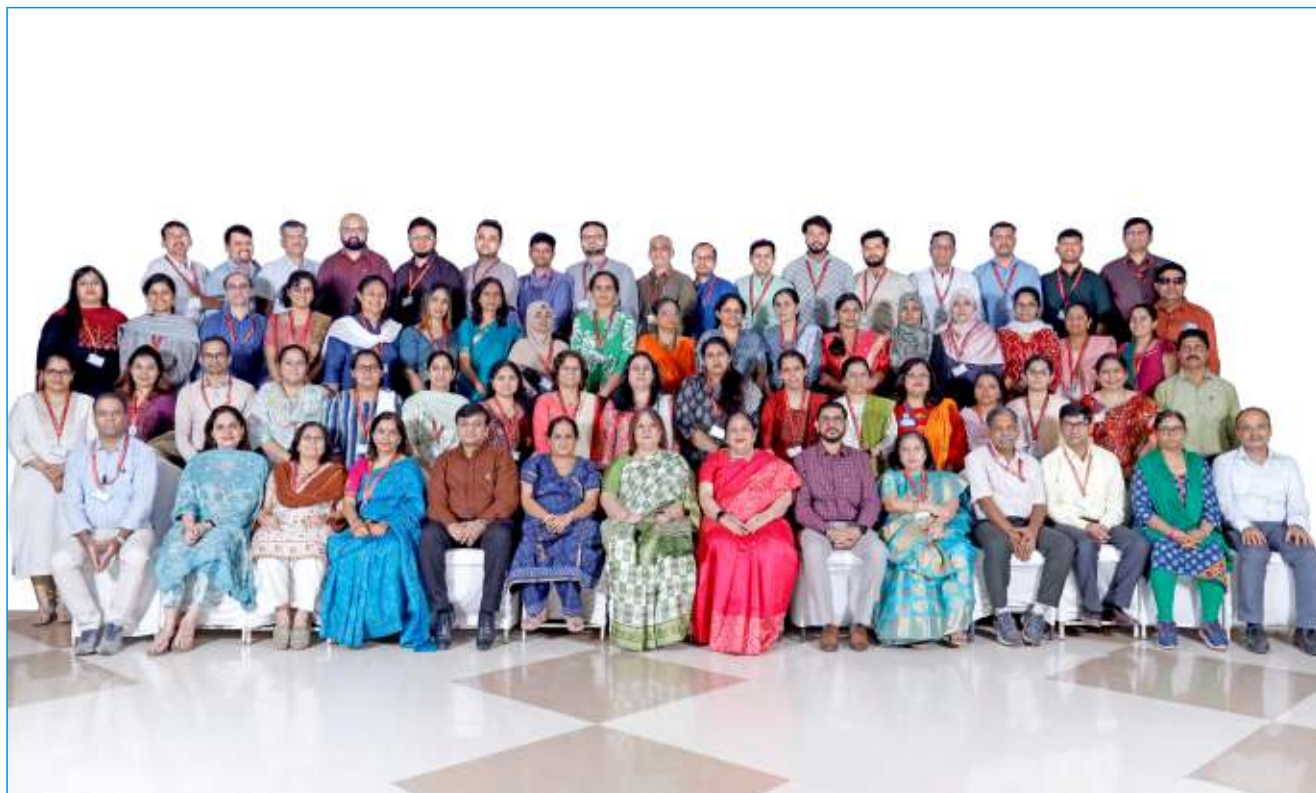
Degree College Faculty of Science