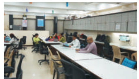
Staff Common Room