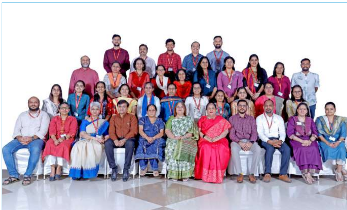
Degree College Faculty of Arts