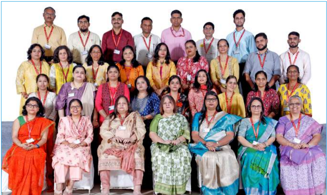
Junior College Faculty of Commerce