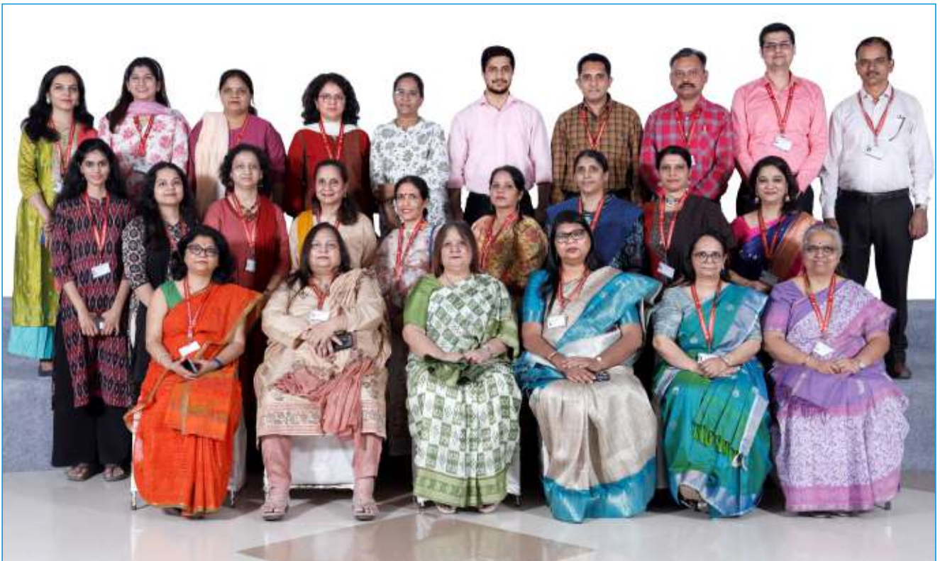
Junior College Faculty of Arts