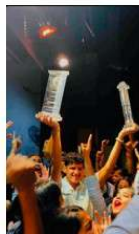
Participant students at the Annual Day & Annual Talent Search - 2024-25 along with variety of events in Dance, Theatre, Music, Fashion Show, Fine Arts, Literary Arts etc.