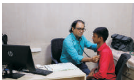
Health Care Centre