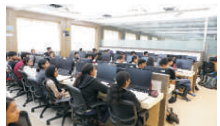
Computer Science Lab