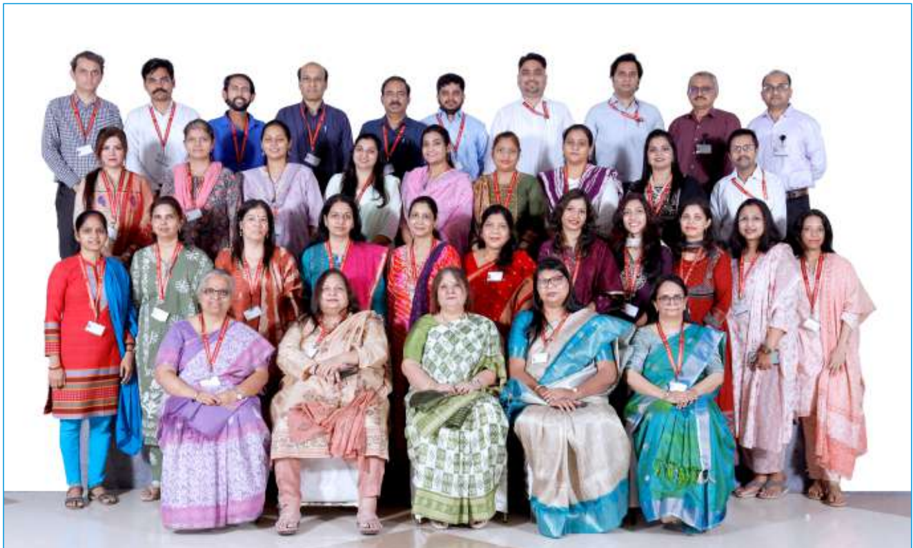
Junior College Faculty of Science