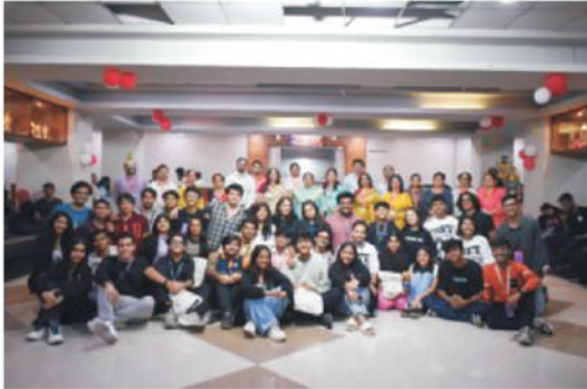
WINNERS – ZONE-III CHAMPIONS, UNIVERSITY OF MUMBAI