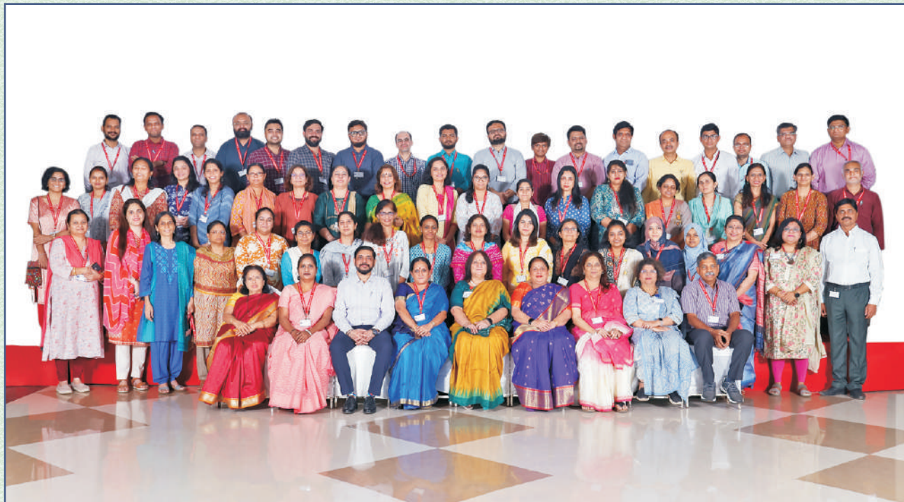
Degree College Science Faculty