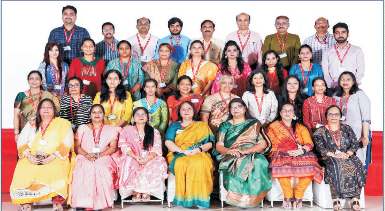
Junior College Science Faculty