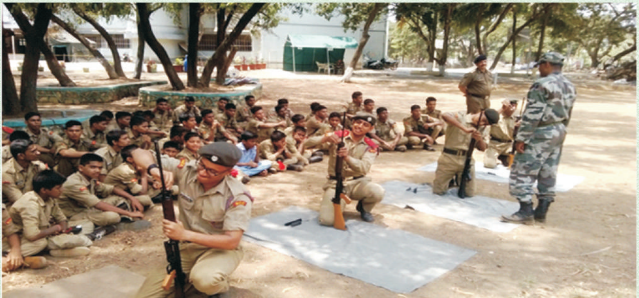
Weapon Training SLR, INSAS