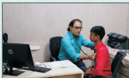
Health Care Centre