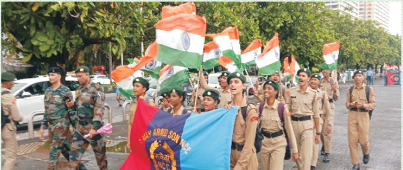
Har Ghar Tirangaa Rally