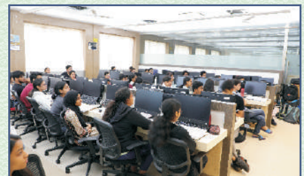
Computer Science Lab