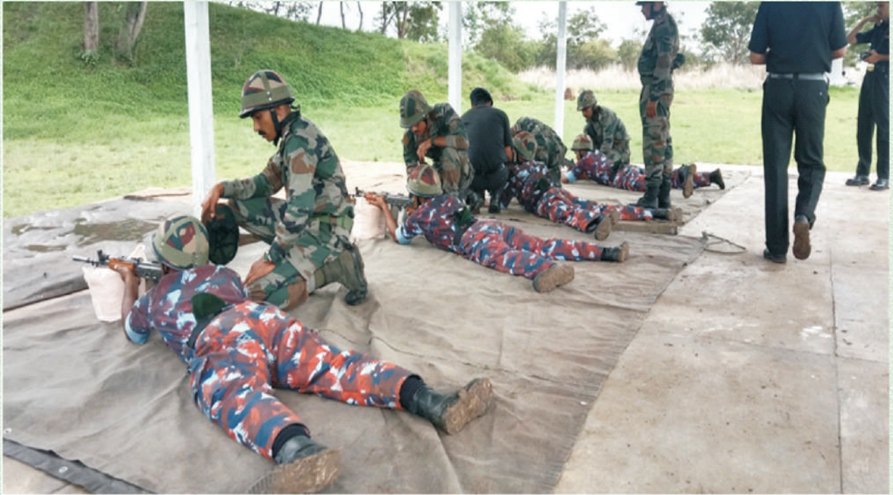
NCC Cadets doing Firing practice on INSAS Rifle at Army Attachment Camp Pune.