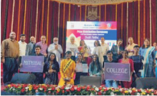
WINNERS – UNIVERSITY OF MUMBAI, YOUTH FESTIVAL