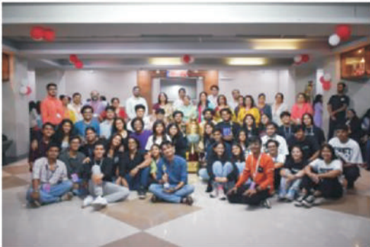
WINNERS - Mood Indigo by IIT MUMBAI