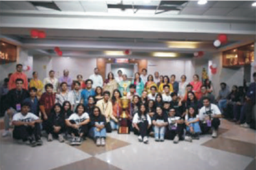
Overall Champions Team for the 1st edition of HSNC University's Idalia