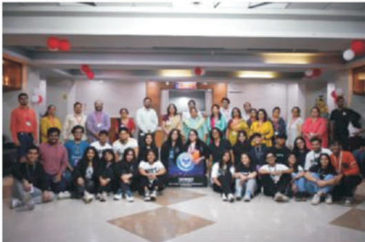
WINNERS - Off D' Cuff