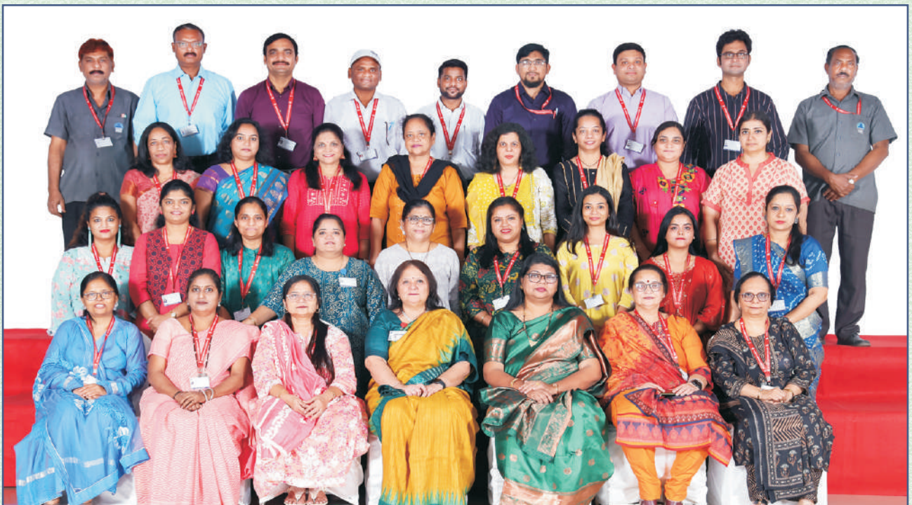
Junior College Commerce Faculty