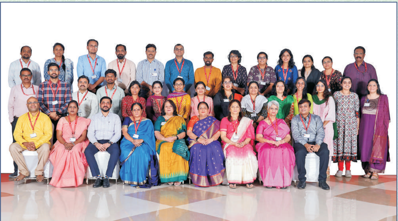
Degree College Arts Faculty