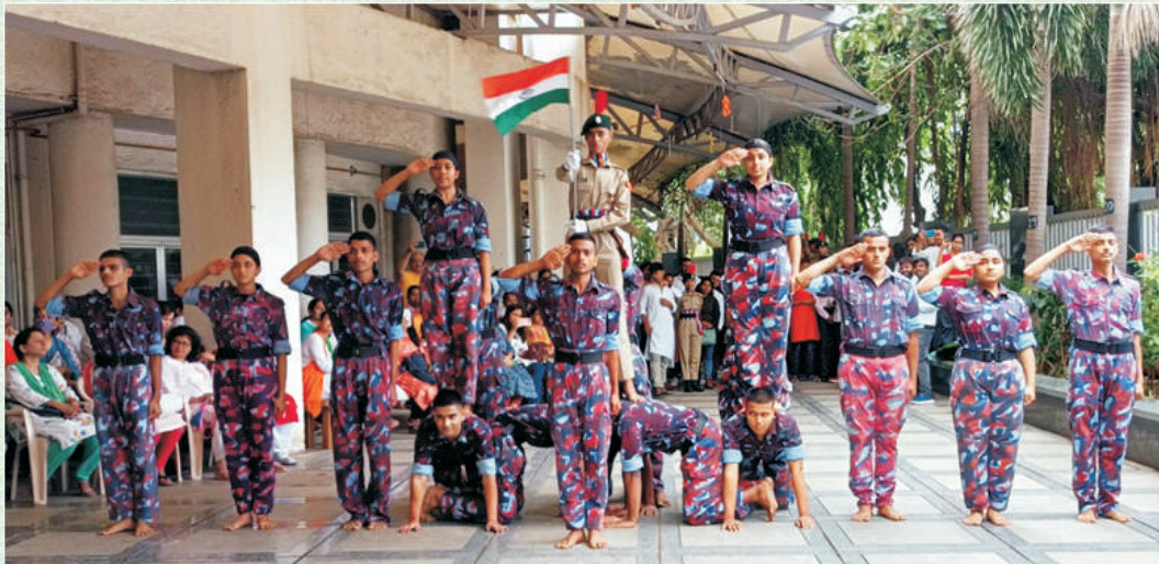
NCC Cadets performing Pyramid show on Independence Day