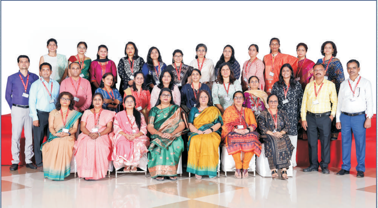
Junior College Arts Faculty