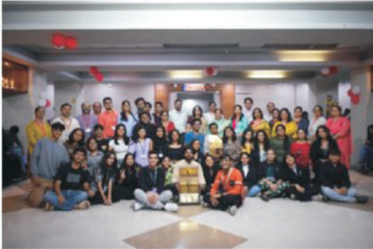
WINNERS – IPTA BEST PRODUCTION-2 ND POSITION