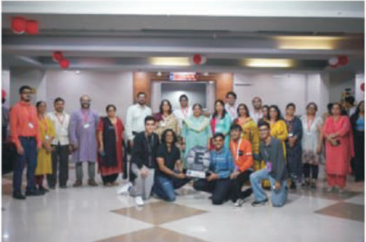
WINNERS - Enigma