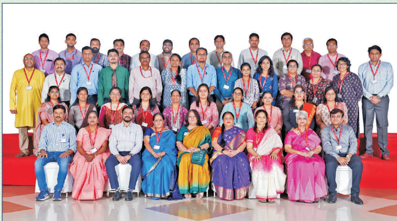
Degree College Commerce Faculty