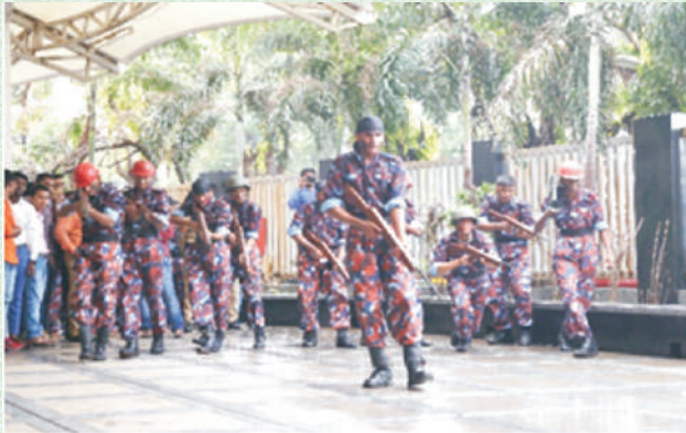
Section Attack Demonstration