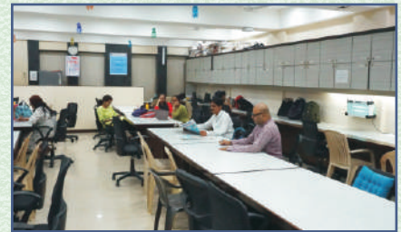
Staff Common Room