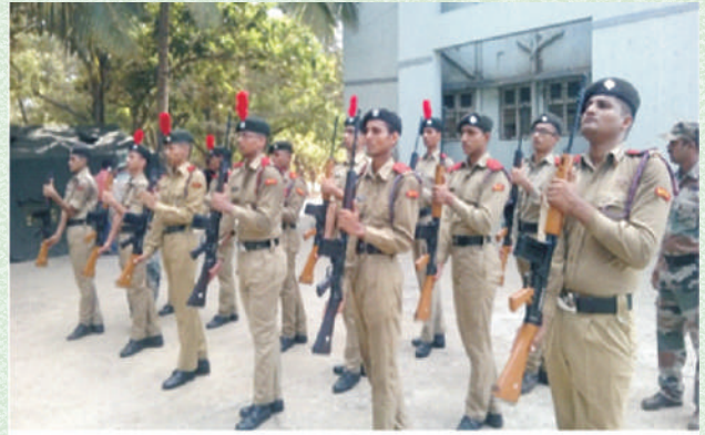
Rifle Parade (Guards)